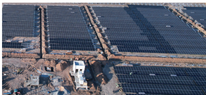
Amplus - 72 MW (Ongoing)