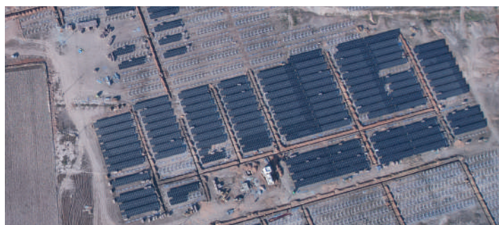
Thermax - 90MW (Ongoing)