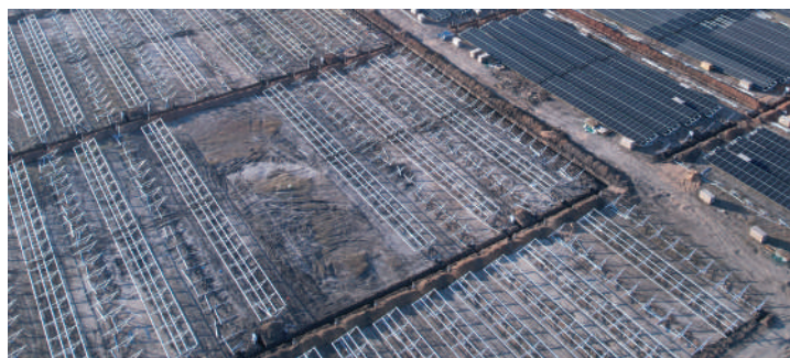
Clean Max - 100 MW(Ongoing)