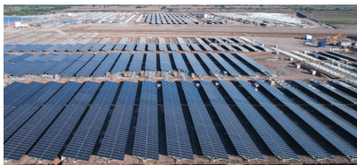
Rohan Solar - Karnataka