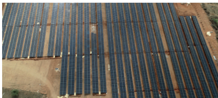
SAML - Tamilnadu